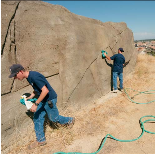
When taggers are successful, annoying graffiti is simply wiped away.