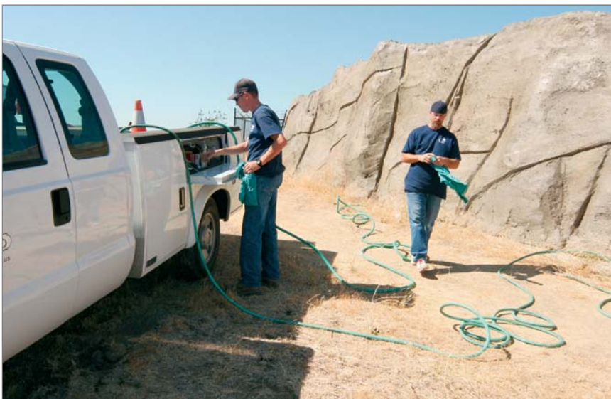
Graffiti Proofer Anti-Stick from SEI Chemical was applied to the rock facade surrounding Brentwood’s new water tank in a one-time spray.

“But even when we did decide to go with the graffiti proofer coating,” continues the Brentwood spokesman, “we anticipated having to apply the initial coating and then re-apply the coating on a periodic basis. Added to this was the inevitable cleaning when taggers did get through. We saw this as an expensive, rigorous, and a never-ending task. In that the coatings make it difficult or impossi-